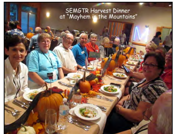
SEMGTR Harvest Dinner at "Mayhem in the Mountains"