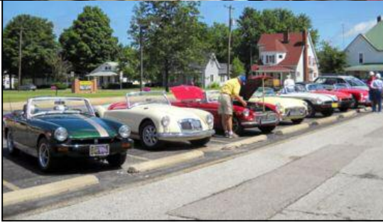
Tucker on the Turn