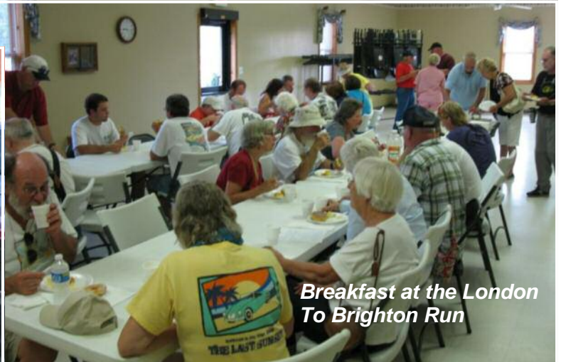
Breakfast at the London To Brighton Run