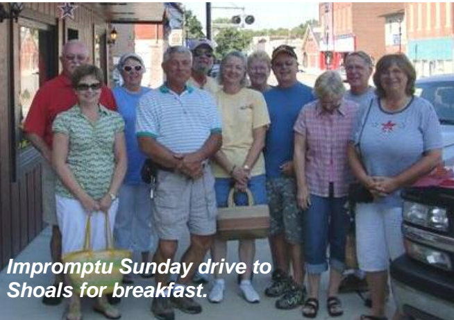
Impromptu Sunday drive to Shoals for breakfast.